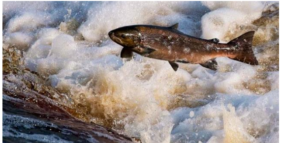
Atlantic Salmon migrating upstream.

Please note that works in watercourses are restricted from October through to the end of May to protect fish spawning, migration, and other biodiversity. Please ensure you apply for Land Drainage Consent in good time to allow appropriate works to be programmed and completed during the summertime window when river levels are low and there are fewer environmental impacts.